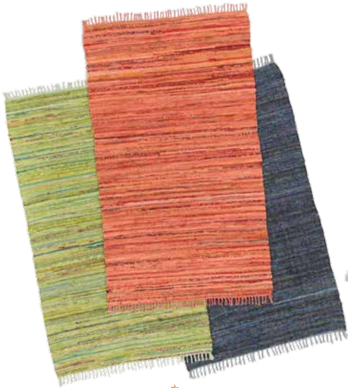
★ For effortless cleanups, choose cotton throw rugs. 3' x 5' Recycled Chindi Rugs , World Market stores , $40 each

Don't go overboard with aquatic accessories. A few ocean-themed coffee- table books or shell motifs can do the trick. Blue Coral Embroidered Lumbar Pillow Cover , potterybarn.com , $50