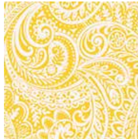
★ Let in maximum light by opting for window panels or valances. Waverly Eazy Breezy Fabric in Citrus