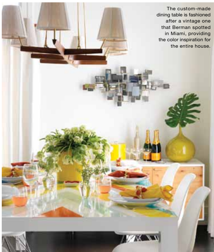
The custom-made dining table is fashioned after a vintage one that Berman spotted in Miami, providing the color inspiration for the entire house.