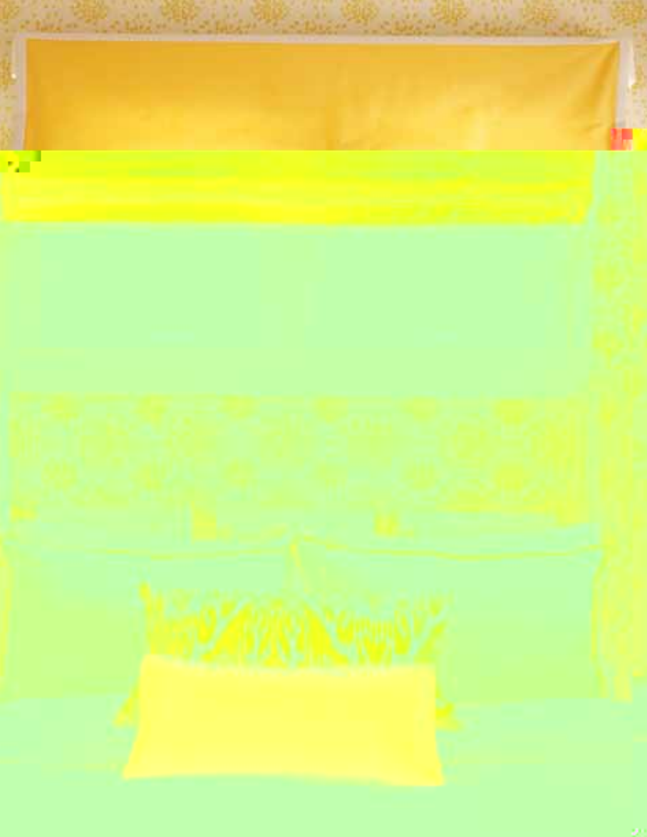
CLOCKWISE FROM LEFT: The guest room beckons in sunny yellow; dashes of pink were added to the yellow, orange and turquoise color scheme; Fermob's Costa extension table adds a pop of turquoise to the deck.