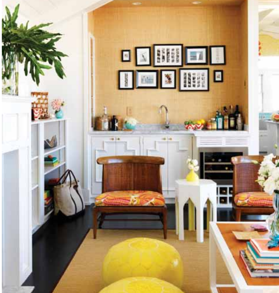
THIS IMAGE AND OPPOSITE: Family photos are hung against grasscloth above the wet bar in a corner of the living room. The white furniture and woven vinyl rug provide a neutral base for brightly colored pillow and curtain fabrics.