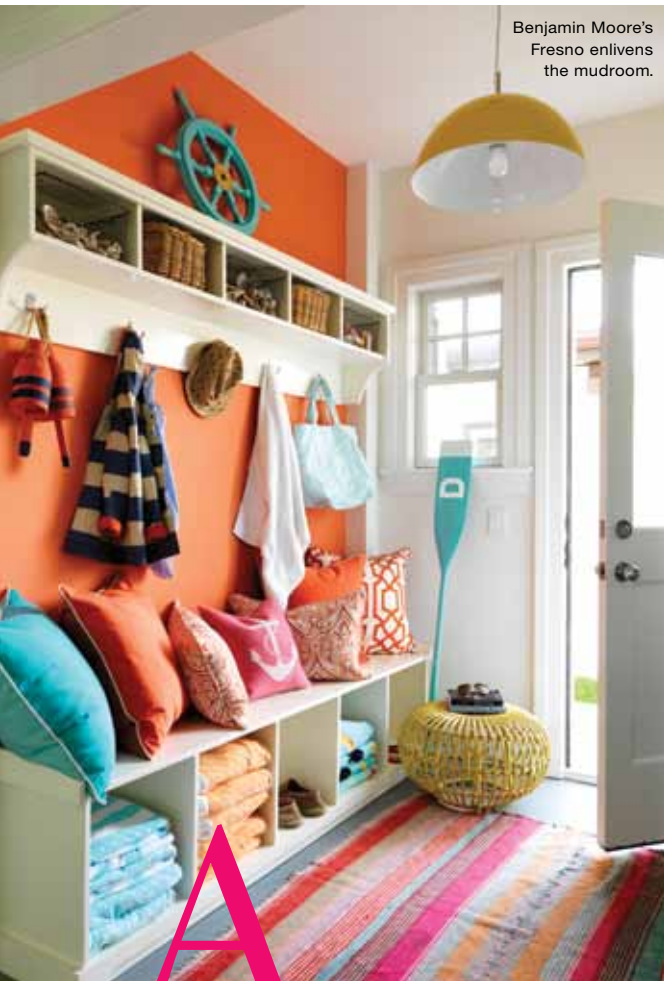
Benjamin Moore's Fresno enlivens the mudroom.