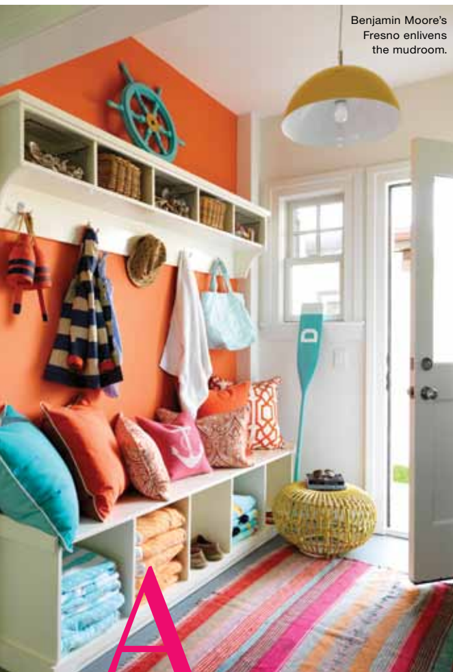
Benjamin Moore's Fresno enlivens the mudroom.